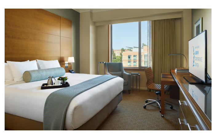
Guest Room with complimentary Wi-Fi and built-in workspace