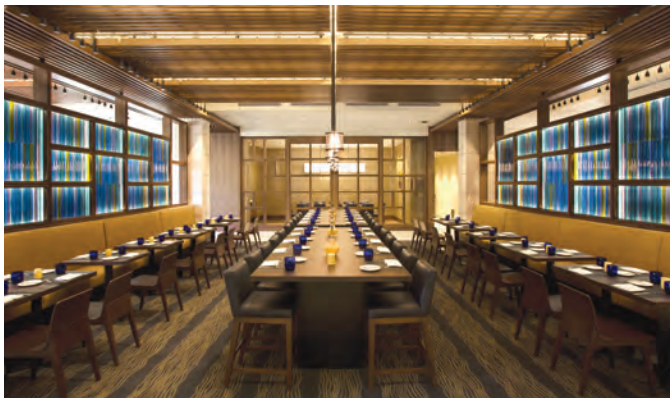
Plateia—on-site Mediterranean-inspired restaurant and lounge

The UCLA Meyer and Renee Luskin Conference Center is designed to serve the needs of individuals and groups attending campus meetings or events; those doing business with UCLA entities; and University of California faculty, students, staff and other University affiliates. All conferences, programs and events held at the Luskin Conference Center must have an eligible learning or educational purpose. All requests to reserve meeting space at the Luskin Conference Center will be reviewed for approval to ensure the activity is in alignment with the university’s mission of teaching, research and service.